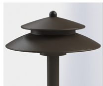
CP3 (Two Tier)