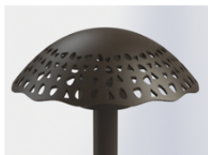
CP4 (All Star)